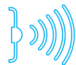
Entry and exist sensors