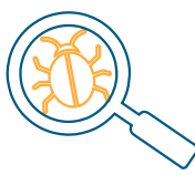
Cyber threat detection

The security services catalogue is delivered via the Datacentrix Security Operations Centre (SOC), which is operated by an expert team of certified security specialists. The SOC provides actionable information to help customers respond to attacks faster, including: