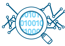
Security posture assessments