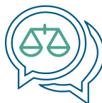
Enterprise IT governance