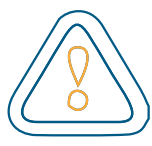
Integrated risk management