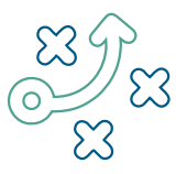
Prioritisation and response